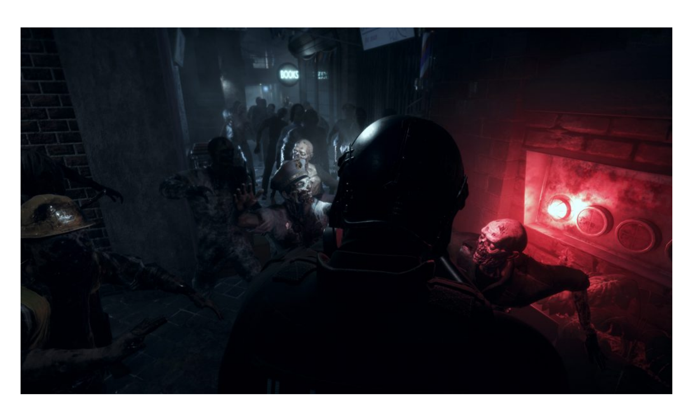
<u>Daymare: 1998 Crack Download Offline Activation</u>